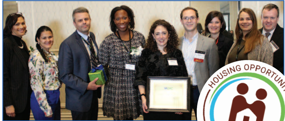
At the 2017 Virginia Governors Housing Conference, HOME was honored to receive the Inclusive Community Award for its Move to Opportunity Program.

Housing Opportunities Made Equal of Virginia, Inc. (HOME) is a nonprofit that seeks to address individual and structural discrimination in housing. HOME began to offer its Move to Opportunity program in January 2014 and receives funding from the Virginia Department of Housing and Development, the City of Richmond, and local foundations. The organization offers housing counseling and education for homeownership, foreclosure prevention, tenancy, financial literacy, and reverse mortgage, as well as engages in research and advocacy work to advance fair housing throughout Virginia. The program partners with four housing choice voucher administrators in the Richmond